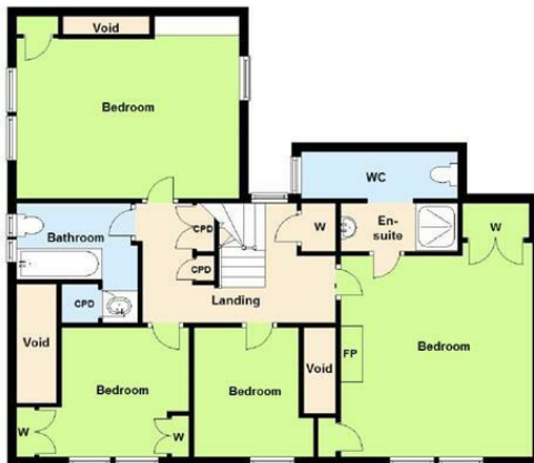
First Floor Approx. 100.4 sq. metres (1080.8 sq. feet)