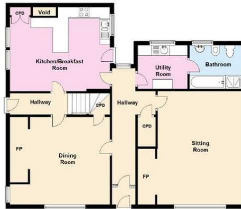
Ground Floor Approx. 100.6 sq. metres (1052.7 sq. feet)